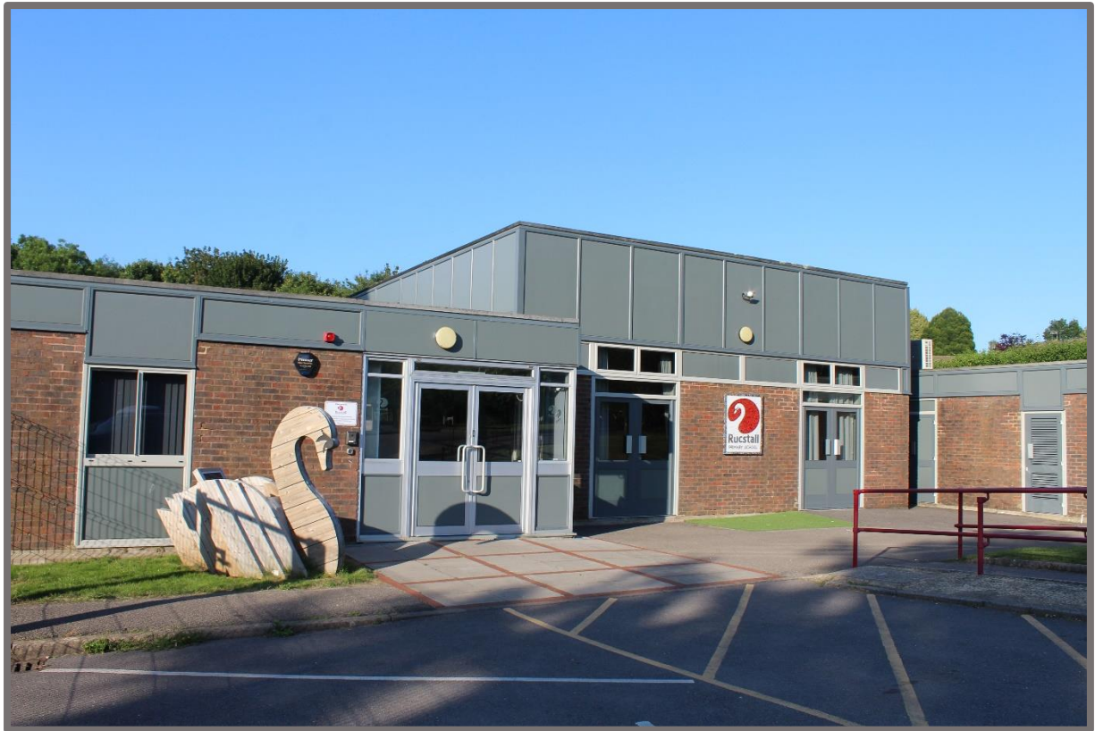
I am part of Rucstall Primary School.