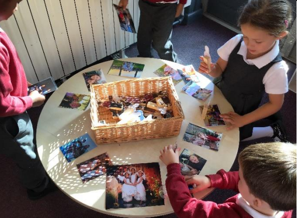
We have been learning about families and sharing who is in our family. All our photos are on the wall and we have been matching the family to the mini me.