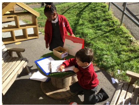
We have been practicing writing our letters. We know lots of letters now such as m, a, s, d, t, l, and n!