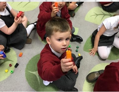
In Maths, we have also been sorting items. Here we were sorting them by colour.