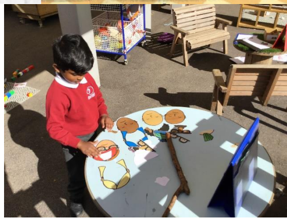
We have been exploring what our face looks like and creating different faces out of different materials. We are going to paint our own portraits inspired by Holbein.