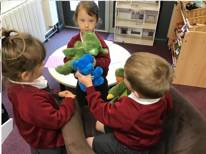
We read the story When a Dragon goes to School and played dragons making sure we behaved!