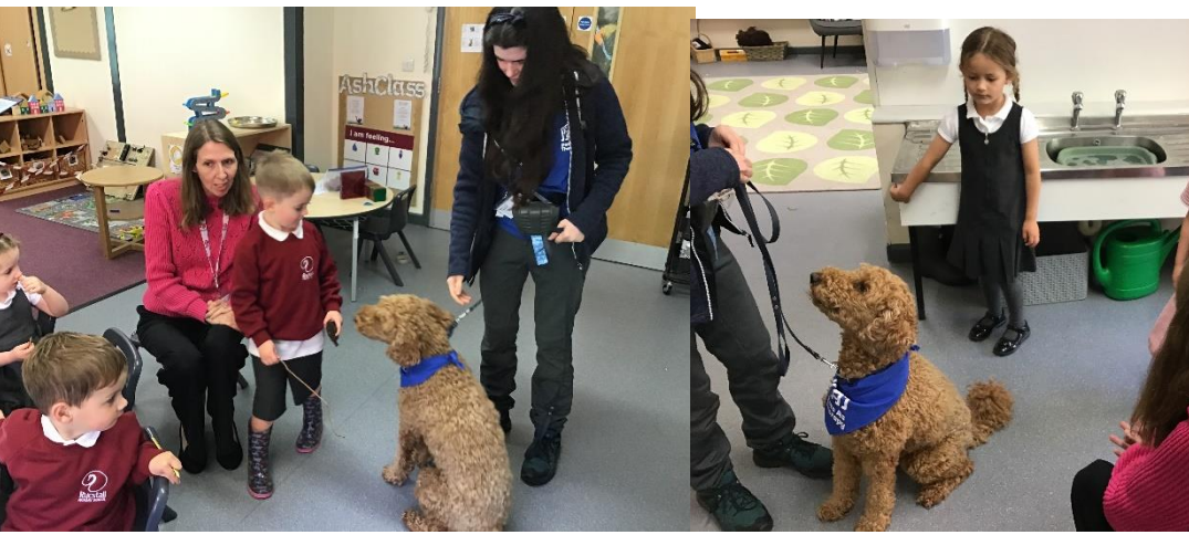
We had a visit from Rusty. He is a therapy dog that visits school sometimes.