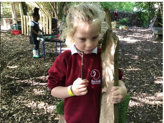
In Maths, we have been looking at comparing size and thinking about whether things are big or small. We found sticks, leaves and blocks and sorted them into whether they are big or small.