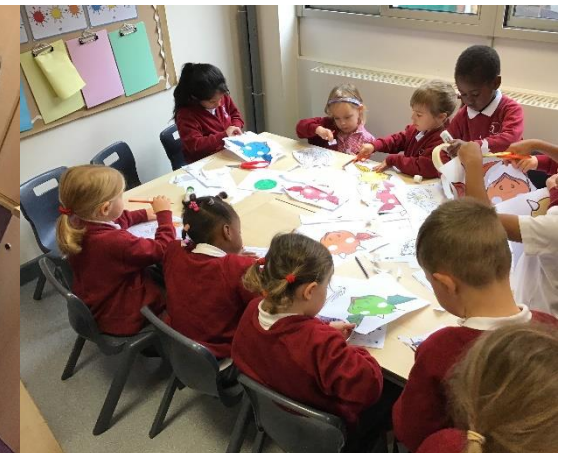
Inside we played with the marble run and made dragon masks.